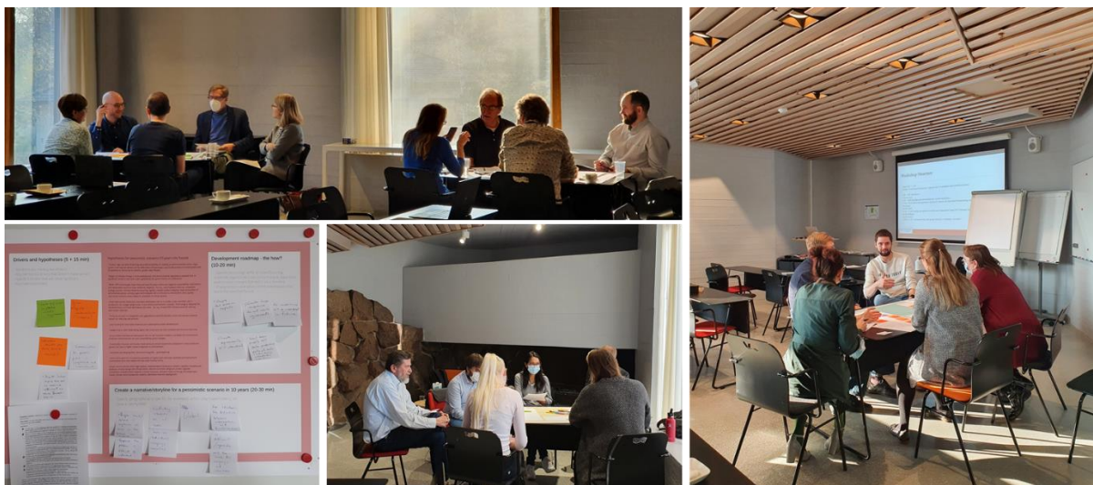
Scenario development workshop that took place during November 2021.

Change drivers are trends and megatrends that will affect the future occurring of an event within a defined scope. It includes uncertainties and assumptions. Trends are events that are happening around at any given time. They occur over a shorter period of time and have local impact. Megatrends are events that have persisted for a long time and that are expected to continue for many more years with a worldwide impact.